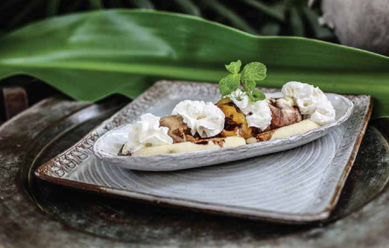
64 କାଣ୍ଡେପଞ୍ଚାମୃତ Banana split $5.50